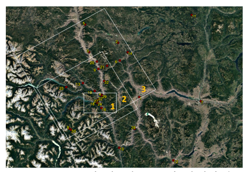
Map courtesy of Google, Landsat, Province of British Columbia, ©2016