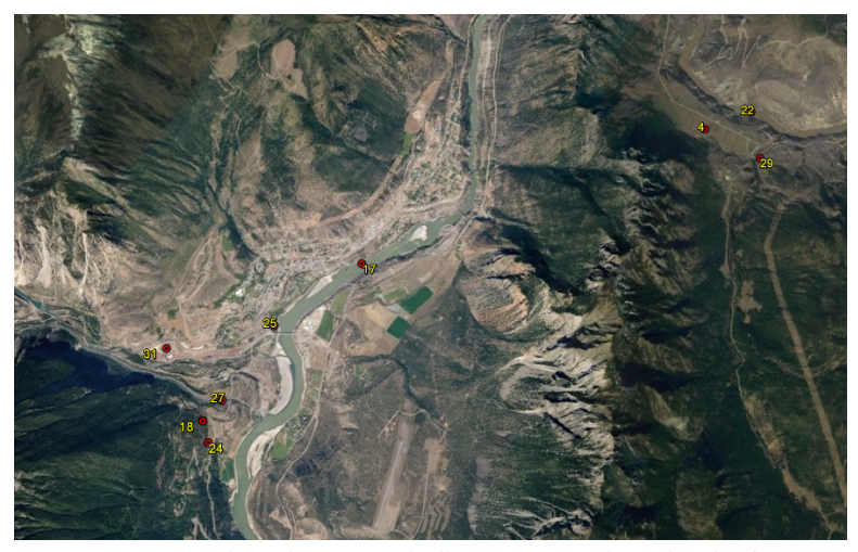
Map courtesy of Google, District of Lillooet, Province of British Columbia, ©2016 Map 1: Aerial view of Lillooet and the Fraser River