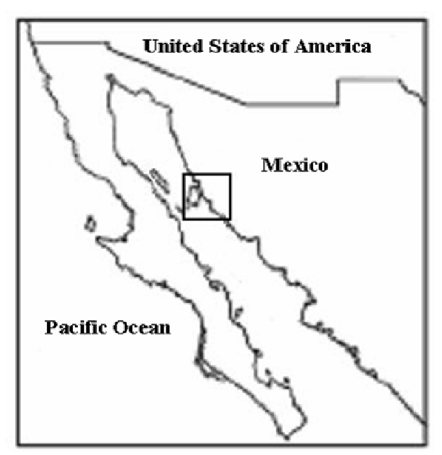
Figure 1. Approximate location of the Seri territory (adapted from Moser & Marlett 2005).

As of 2007, there were reported to be around 900 Seri speakers (Lewis 2009). See the map of the location of the Seri territory in Figure 1.